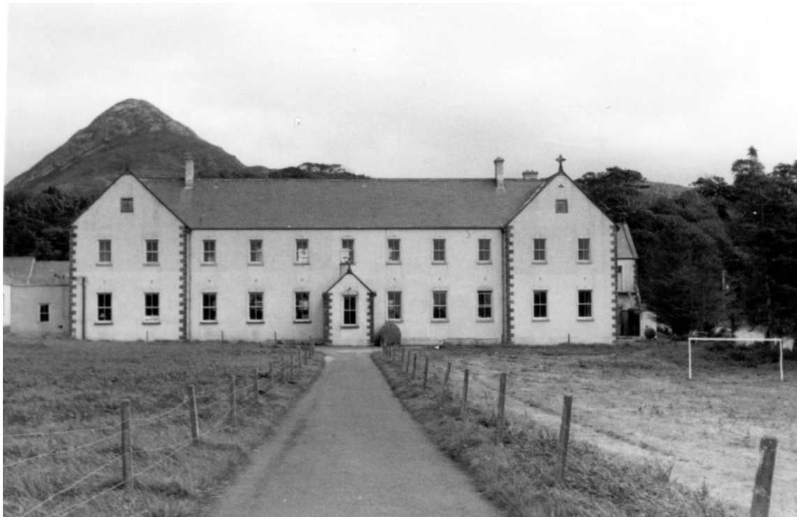
(taken in the early 1970s).